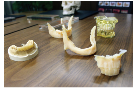
3D printed dental models used to test fitting of fixtures

"3D printing allows us to reproduce real-life conditions and create customized tools, helping us make the optimal decision for every patient and perform surgeries smoothly. Patients are better consulted on the treatment procedures and outcome, resulting in higher confidence and satisfaction," said Dr. Wu.