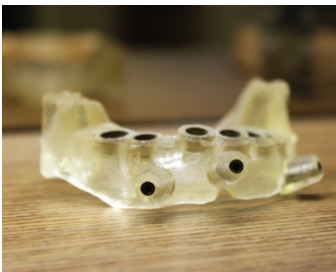
3D printed dental guides to accurately locate implants

The Sense & Beauty Dental Clinic (SBDC) in Taiwan is a one-stop dental center offering a range of comprehensive dental services to over 10,000 patients annually. Since its start in 2005, SBDC has emphasized the use of advanced technologies in diagnoses, dental treatments and training for practitioners.